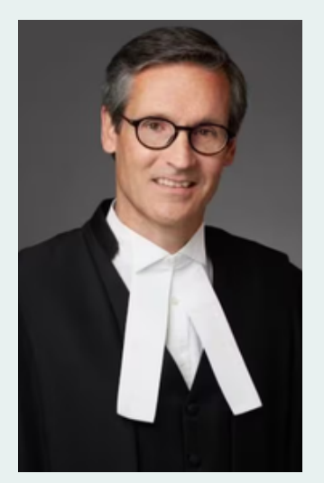
© British Columbia Court of Appeal