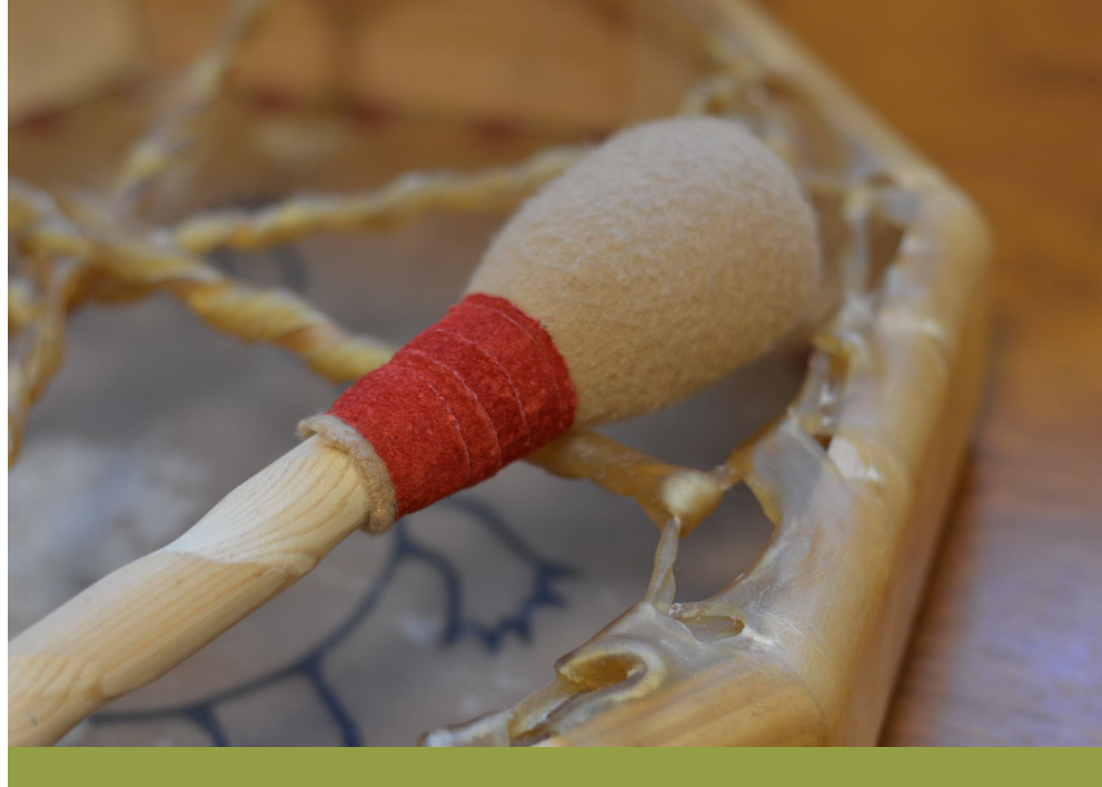
Photo by Alice Joe ( alicejoe.com ), page 31 of Expanding our Vision