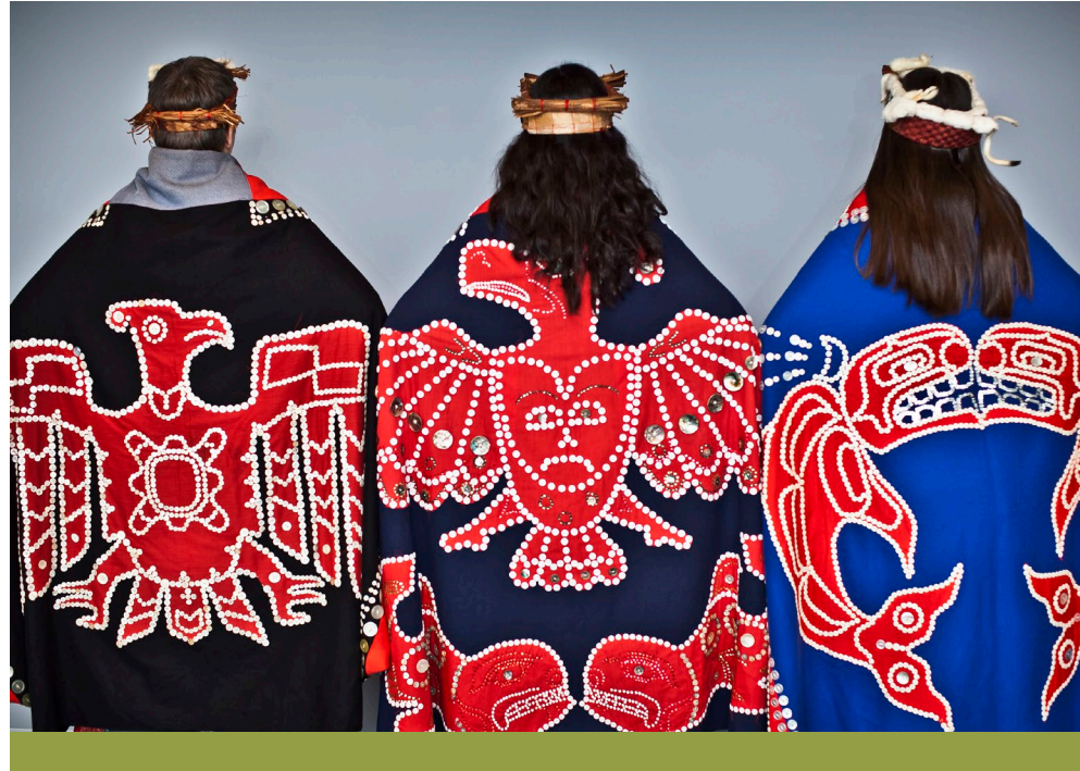
Photo by Nadya Kwandibens, RedWorks Studio, page 27 of Expanding our Vision