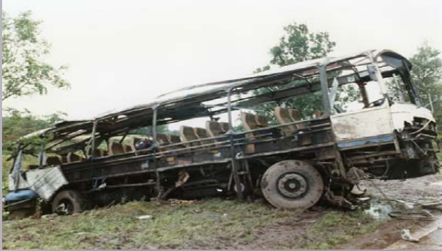
8 Dead and 13 Injured