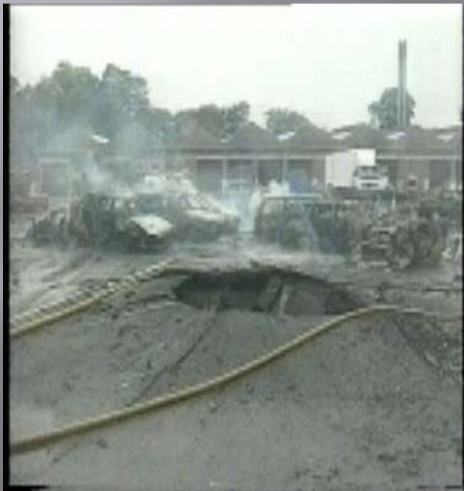
1 Dead and 31 Injured