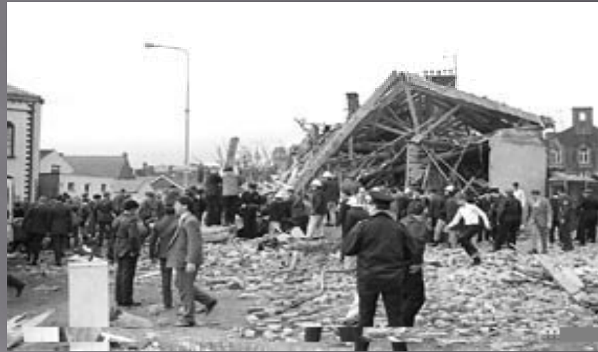
12 Dead and 63 Injured