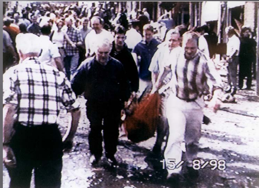
32 Dead and over 200 Injured